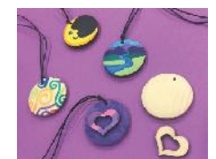
DIY FREE Wood Pendant Craft