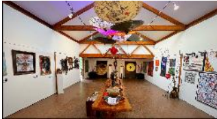
Amazing creations by local artist.

8 REIMER'S CANDIES AND GIFTS * 42375 Sierra Drive