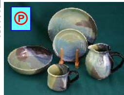
ANNE AND HJ BROWN Pottery

1 RIVER WATER POTTERY 44305 South Fork Drive