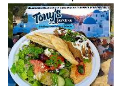
TONY'S TAVERNA ON WHEELS Greek Cuisine Burgers & Fries

1 RIVER WATER POTTERY 44305 South Fork Drive